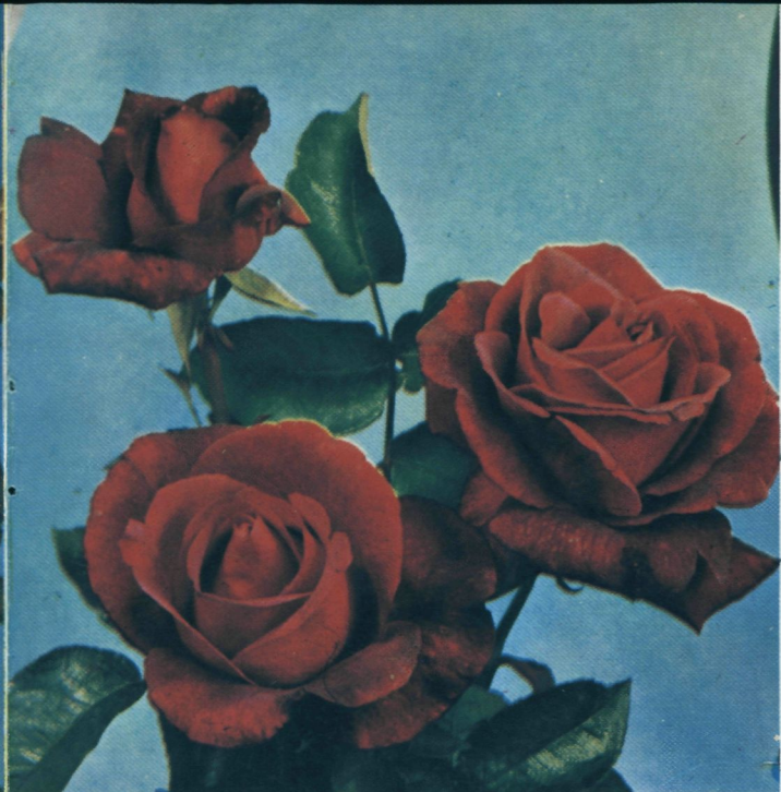
Josephine Bruce , free and fragrant; growth entirely satisfactory; should not be missed. Highly recommended. F.C.C. 5/-. Hebe (by Dicksons of Hawlmark), A Rose with a strong appeal. G.M., F.C.C. 5/-.